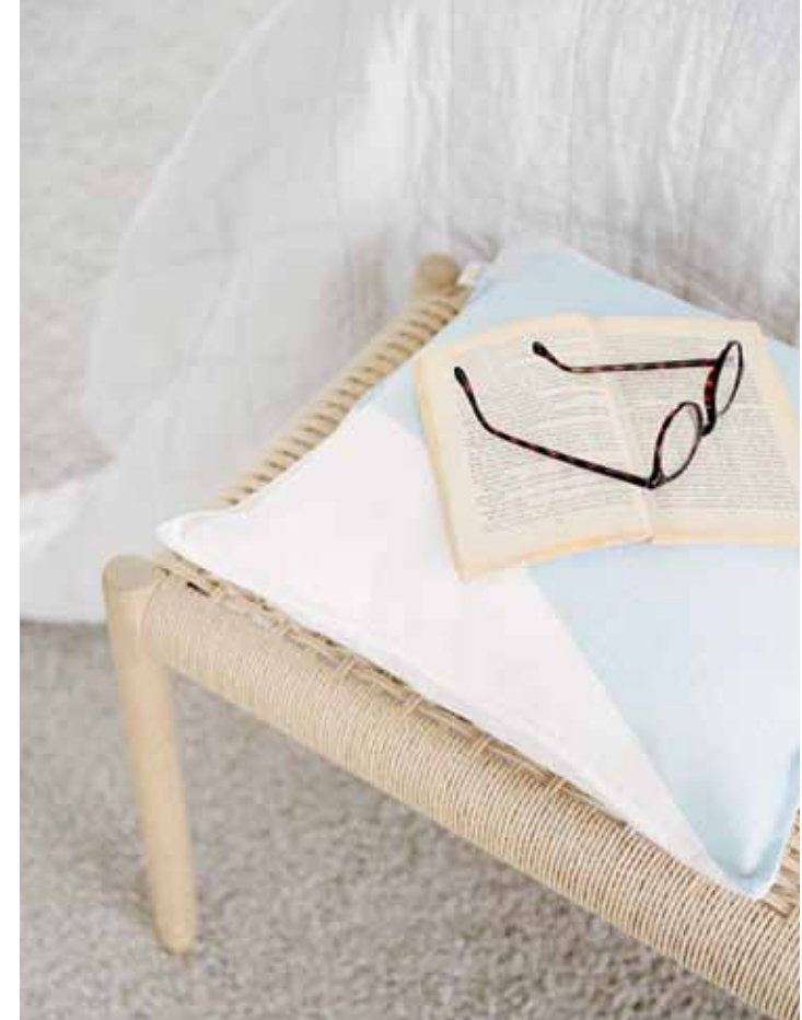
MASTER BEDROOM (opposite & above) This neutral-toned and calm space showcases form with the Moller ‘#63’ bench from Great Dane and the ‘Paloma’ table lamp, Xavier & Me cushion and Sheridan ‘Abbotsdon’ quilted bedcover, all from Zanui. ENSUITE (below) The Licht pendant light from Koskela gives a hint of sky blue to this elegant pamper zone with the tapware and basin from Reece and a Carrara marble benchtop.