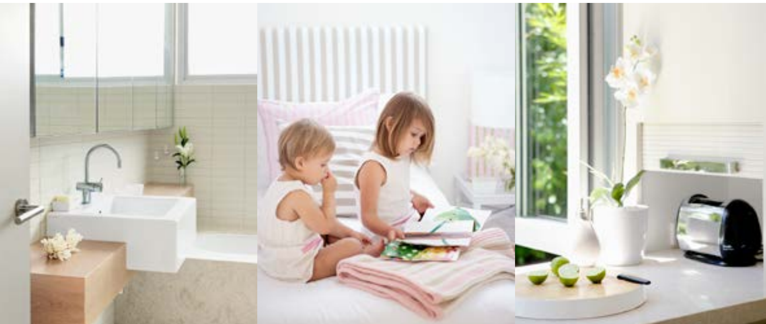
A deep-set bath, timber-veer finishes and stacks of natural light keep this bathroom (above, left) fresh. Mimi and Pia (above) play in a lighthearted room custom-designed for little girls, with just the right amount of pretty pink. In the kitchen (above right and opposite page), instead of a splashback above the sink, architect Nicholas opened up the room with bi-fold windows, to let in more light and reveal the stunning vista of Norfolk Island pines. A stone-topped mobile unit on castors does double-duty as a buffet table when entertaining.