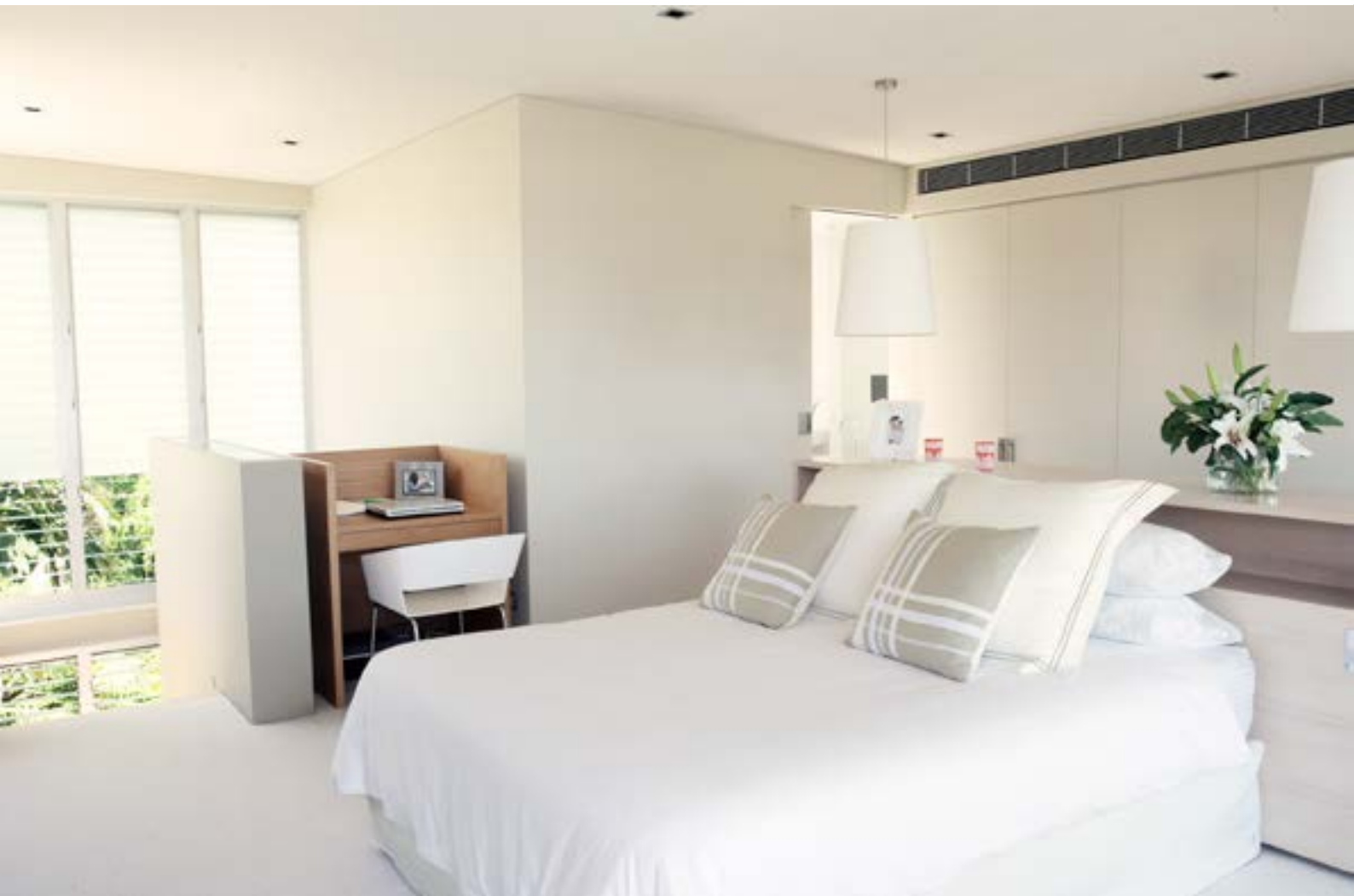
Cleverly positioned, this top-floor master-bedroom retreat has no door, allowing large double-height louvred windows to flood the room with dappled sunlight. Featuring vast built-in wardrobes, ensuite, a cute study nook and overlooking a water feature (below, left), the room serves as a welcome escape from the family hubbub. In the main bathroom (opposite page), easy-to-wash limestone floors are both practical and beautiful, while a deep, freestanding tub is perfect place to soak away an afternoon.